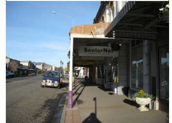
Queen Street Waimate